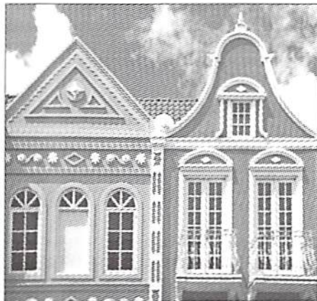
Charming Dutch architecture in Oranjestad.

The constant oceanic rage is so violent, so unsettling in its effect and so eerie in its mood, that one forgets this is sleepy little Aruba, whose op-